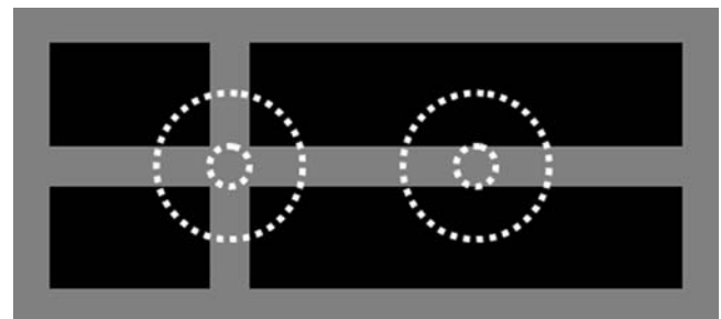
Figure 3. The receptive fields of two cells. For each cell, the inner circle and the area between the two circles represent the regions where stimulation by a light source respectively leads to excitation and inhibition of the cell. Please see the text for further details. doi:10.1371/journal.pone.0000265.g003

However, this theory cannot explain why the detection thresholds measured in Experiment 6 were much larger than those measured in Experiment 1. In Experiment 6 the display consisted of gray squares on a black background (Figure 1d). The disk was always placed on the center square of either the left or right display. When a cell's receptive field is centered on one of these squares, its surround is not stimulated, so the cell receives little inhibition, which should cause it to have a low detection threshold. Conversely, in Experiment 1 the background was a uniform gray, so the surround of a cell's receptive field centered